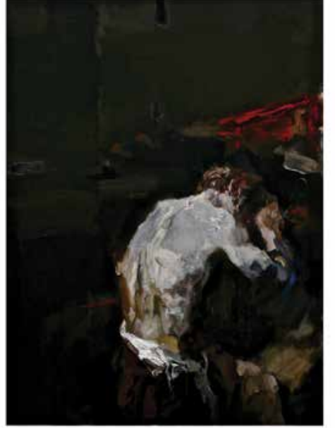
Wang Tuo, The Return of the Prodigal Son , 2016, oil on canvas, each 108 x 145 cm.

illustratable form. I neither appropriate a readymade archive nor display a physical archive. In other words, the visual representation of what people usually understand as "archive" does not appear in my work. Instead, one's awkward state in experiencing my video is always intended to be a metaphor for our relationship with the archive. The archive is how it can be transformed to an act through bodily experience and performative process.