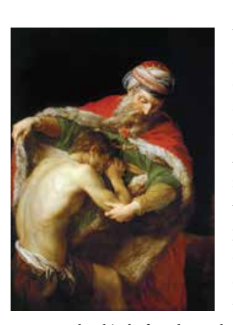
Pompeo Batoni, The Return of the Prodigal Son, 1773, oil on canvas, 138 x 100.5 cm.