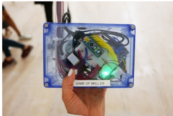
Game of Skill 2.0