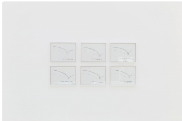
Installation view at SeMA Biennale Mediacity Seoul 2016