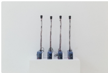
Installation view at SeMA Biennale Mediacity Seoul 2016