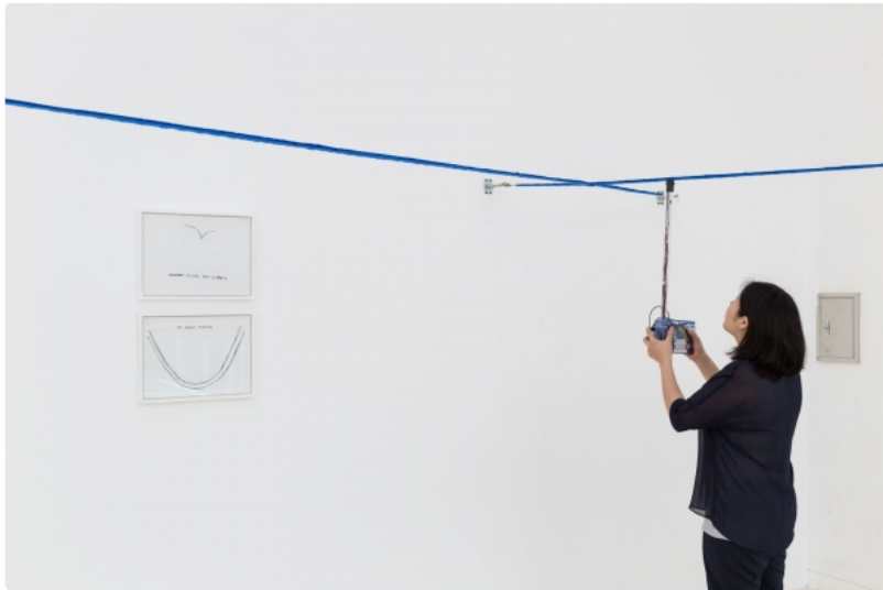
Installation view at SeMA Biennale Mediacity Seoul 2016