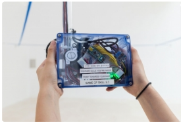
Installation view at SeMA Biennale Mediacity Seoul 2016, Image courtesy of Seoul Museum of Art