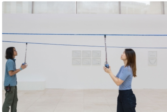
Installation view at SeMA Biennale Mediacity Seoul 2016