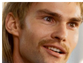
WHY HOLLYWOOD WON'T CAST SEANN WILLIAM SCOTT ANYMORE (HTTP://WWW.ZERGNET.COM)