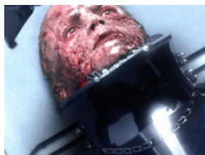
MOVIES THAT WERE RUINED BY ONE SCENE (HTTP://WWW.ZERGNET.COM)