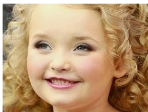
HONEY BOO BOO HAS GROWN UP QUITE A BIT (HTTP://WWW.ZERGNET.COM)