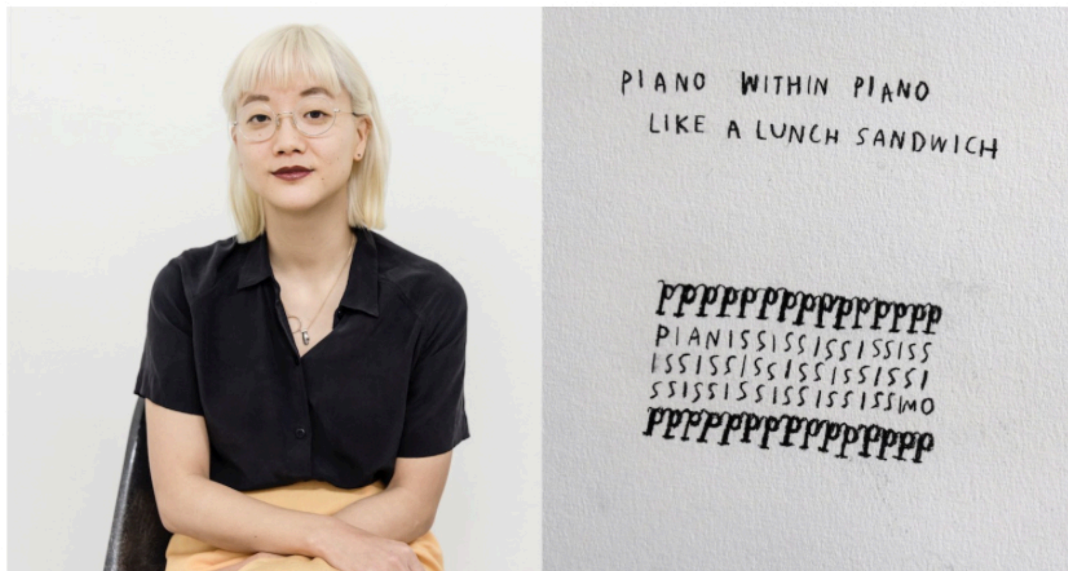
Christine Sun Kim, Piano Within Piano, 2015.