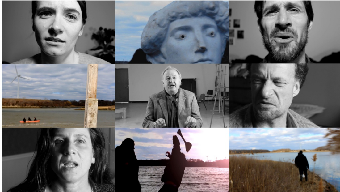
Film Still from Vanitas

They appear both as ghosted objects and physical records of time—transfers of fabrics from illusory performances and successive outlines of bodies in performative acts—resulting in eidolic images of forgotten experience. See more of Tuo's work, including his videos at www.tuo-wang.com